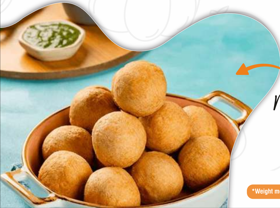
Moong Dal Kachori

*Weight mentioned is approximate; actual weight is as stated on the pack.