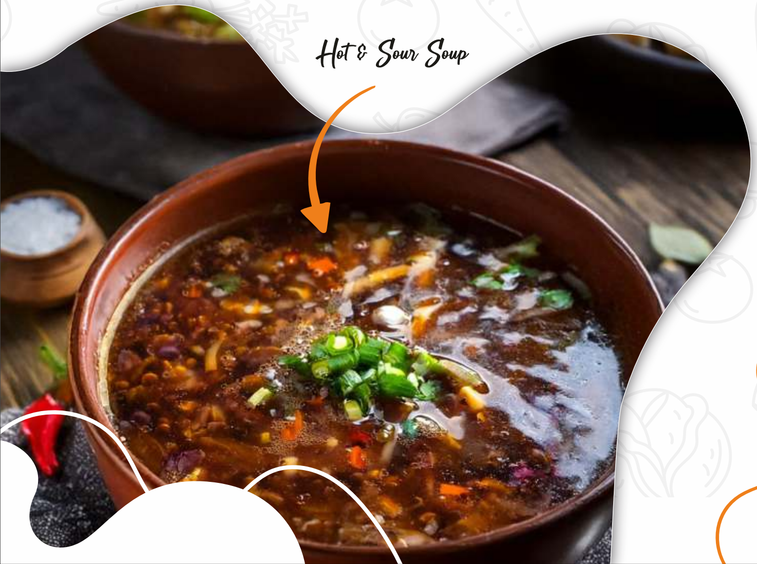
Hot & Sour Soup