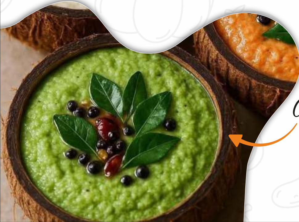
Coconut Chutney Green