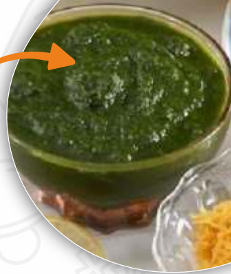
Pani Poori Paste

Bright, punchy, and irresistibly bold, Chaat that wakes up your taste buds from the very first bite.