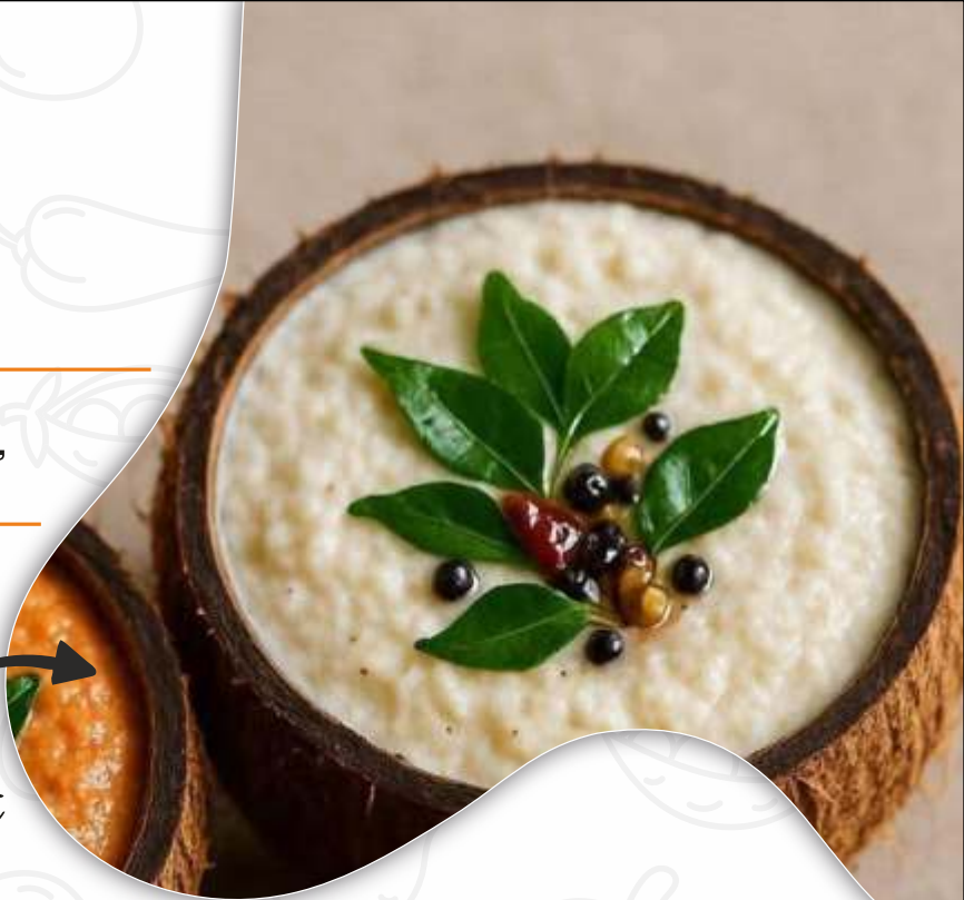
Coconut Chutney White

From coconut to coriander, each chutney captures the true essence of South Indian taste, pure, fresh, and irresistible.