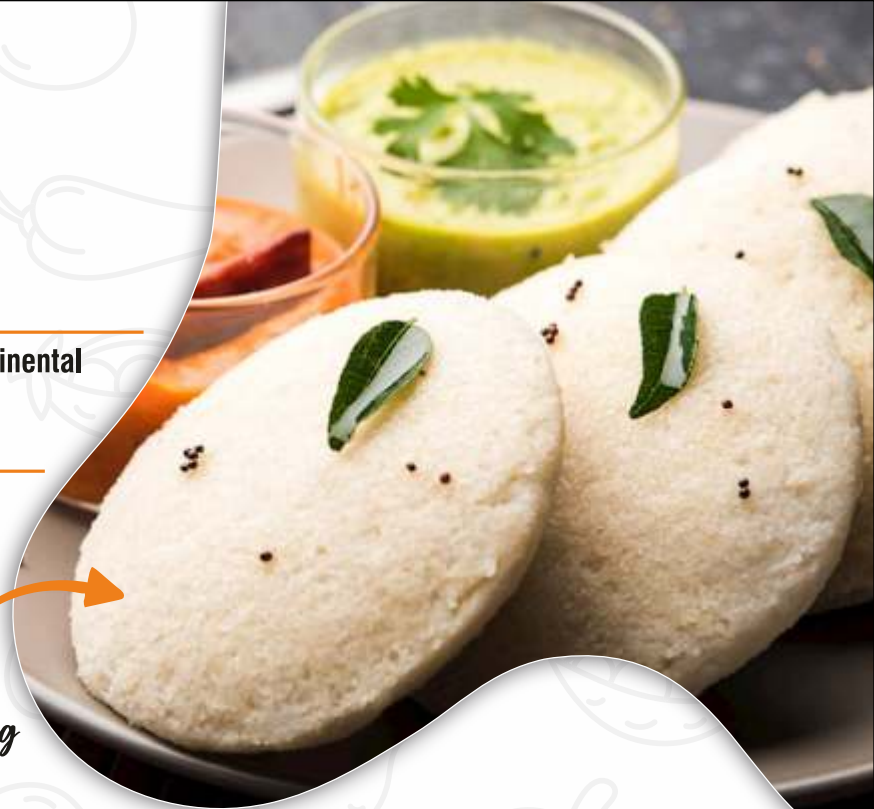
Rice Idli Big

A curated collection of traditional Indian and continental snacks, crafted to satisfy every craving, anytime, anywhere.